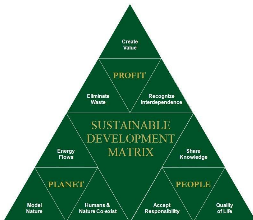
Figure 1. Profit, People and Planet matrix of sustainability in organizations (People, Planet & Profit – Triple Bottom Line. The Ethical Measure of businesses, (2017).

According to the Figure 1 it could be a basis of sustainability development in any organization. Furthermore, based on the principle of equality it can be stated that correlation of the three dimensions is the background of harmonious living and cooperation between employees in organizations (People, Planet & Profit – Triple Bottom Line. The Ethical Measure of businesses, (2017).