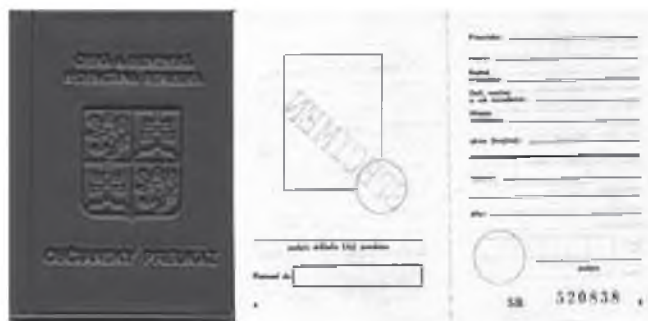
Fig. no. 2 – ID Card ČSFR (1990)