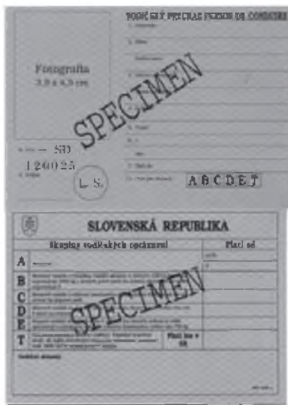
Fig. no. 7 - Driving license SR (do 2004)

the serial number. The data was filled in by a typewriter, later on computer printers. The photograph and data were protected with laminate (Fig. No. 7). The latest model is a driver's license issued since 16 September 2015 (Fig. No. 8).