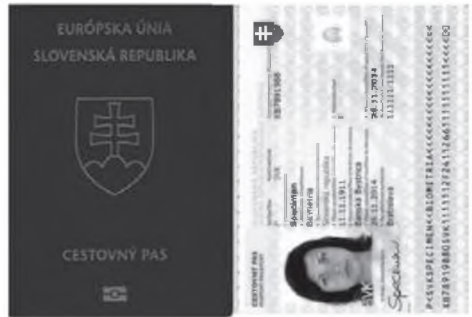
Fig. no. 6 - Passport SR (2014)