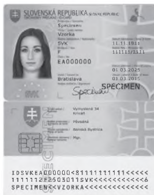
Fig. no. 4 – ID Card SR (2015)