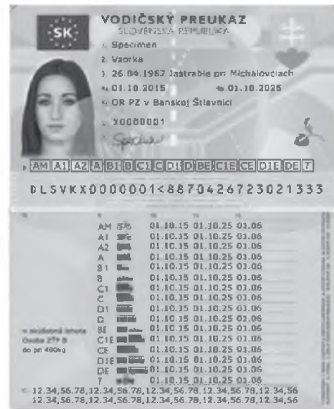
Fig. no. 8 - Driving license SR (2015)