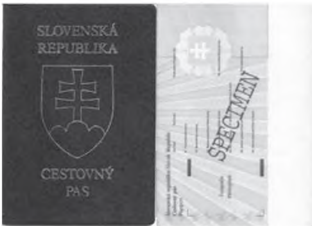
Fig. no. 5 - Passport SR (1994)