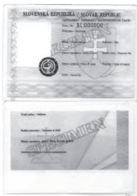
Fig. no. 3 – ID Card SR (1993)