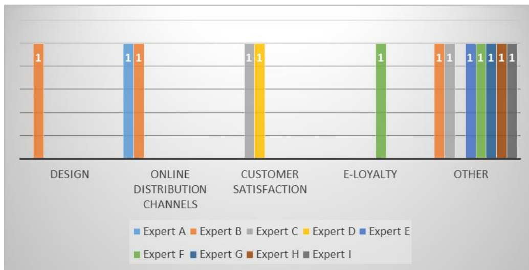
Fig.1. Central qualitative criteria for internet marketing

Respondents also were asked which of the following mentioned qualitative criteria is central according to the development of internet marketing quality. By this question, experts have been asked to distinguish the most important criteria or to propose the additional one, which, according to them, could be applied in the process of internet marketing quality evaluation. The experts' opinions diverged in Figure 1.