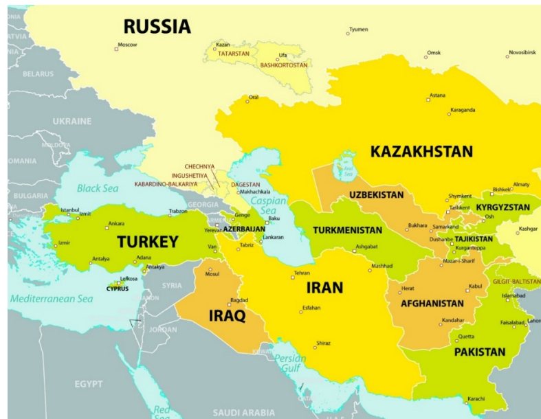
Figure 2. Map of Central Asia with bordering countries According: People International

Central Asia, once shrouded in secrecy and famed for its trans-Asian trade via the Silk Road, is now an open, dynamic region connecting Eastern Europe and West Asia. It is a region rich in natural resources, such as oil and gas, and home to a diverse range of animals and plants. Central Asia, which includes Kazakhstan, Kyrgyzstan, Tajikistan, Turkmenistan, Uzbekistan, is a vast land mass that separates Eastern Europe and the Caucasus from East and South Asia (Organization for economic co-operation and development, 2011). The area of Central Asian region is big enough that can be seen on the map in (Figure 2).