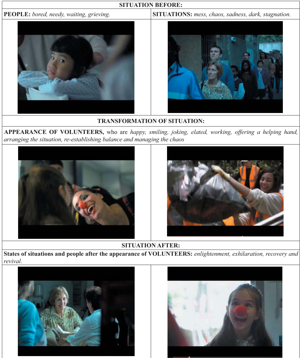
Table 1. Typical narrative logic of EU video texts promoting volunteering

The position of joined hands refers to the act of mutual assistance: hand into hand, offering of a helping hand, holding hands . The joining of hands