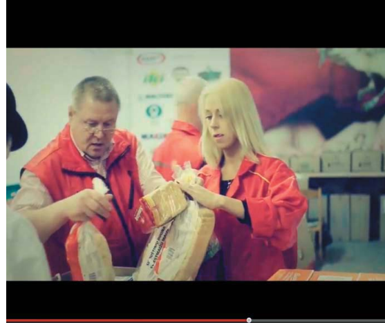
Figure 3. Video texts of the EU Representation Agencies in Lithuania promoting volunteering: creative task visualization solutions

Syntagmatically, in the video "Hymn of Volunteering", the narrative is developed without transformational and missionary distinctions – after getting up in the morning, people go to clean up a city park - to collect trash, and after doing the job they are just getting pleasure of being together. This is the typical situation "after" of the films analysed before, which had normally formed after the occurrence of transformation and appearance of VOLUNTEERS in any situation or after the Hero had experienced the joy of volunteering. While in the video of the Hymn the volunteering is already triumphing, the heroes no longer need to undergo any transformations of individuation, they are already "touched